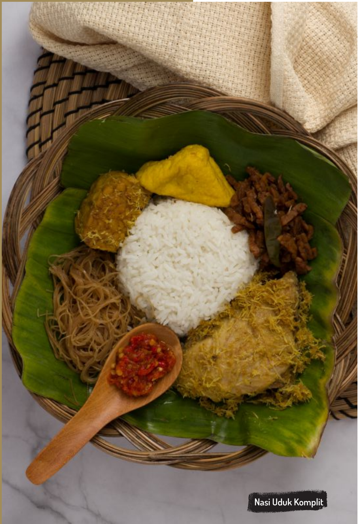
Nasi Uduk Komplit