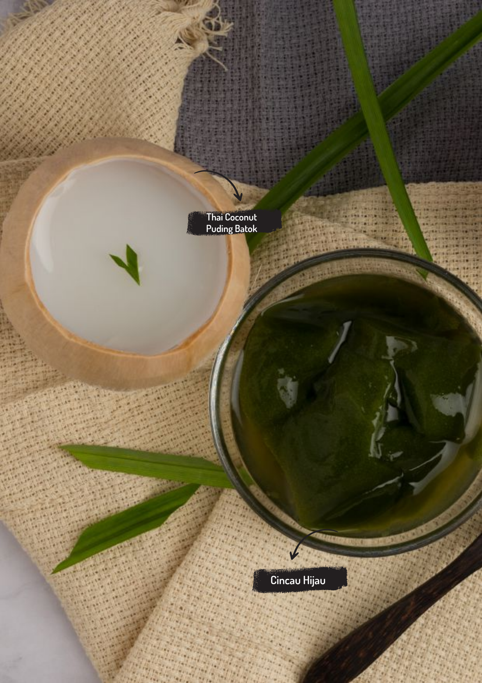
Thai Coconut Puding Batok