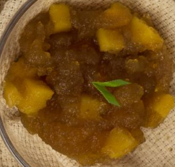
Bubur Sagu Rangi