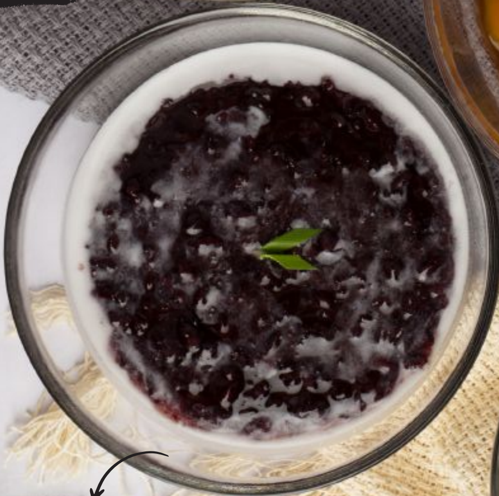
Bubur Ketan Hitam