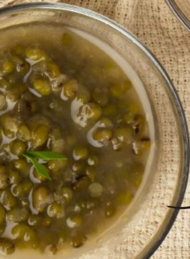
Bubur Kacang Hijau