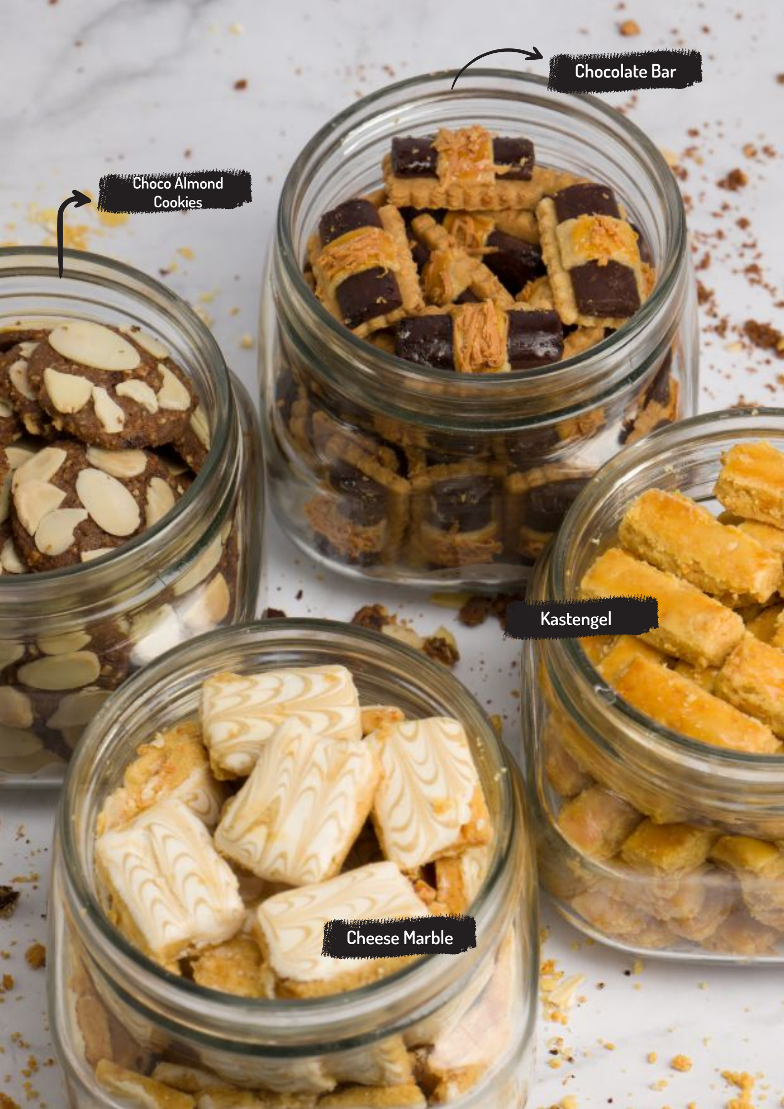
Choco Almond Cookies